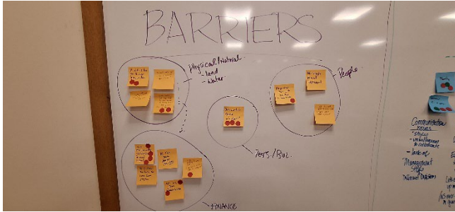
Figure 3. Working through barriers that can prevent BMP adoption.

The complexity of decision making in agriculture highlights that many supports can be needed to increase adoption of BMPs beyond funding supports. For example, one of the recommendations of the research team is the availability of real-time soil health data to help producers identify the right BMPs for their farm.