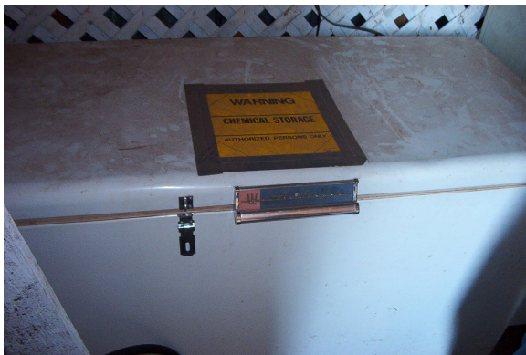
Figure 1: Freezer Storage

When a farm stores small quantities of pesticides (less than 25 L in liquid form or 25 kg in solid form), an old household freezer will provide adequate storage (Figure 1).