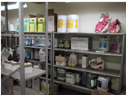
Figure 4: Shelving and Organization