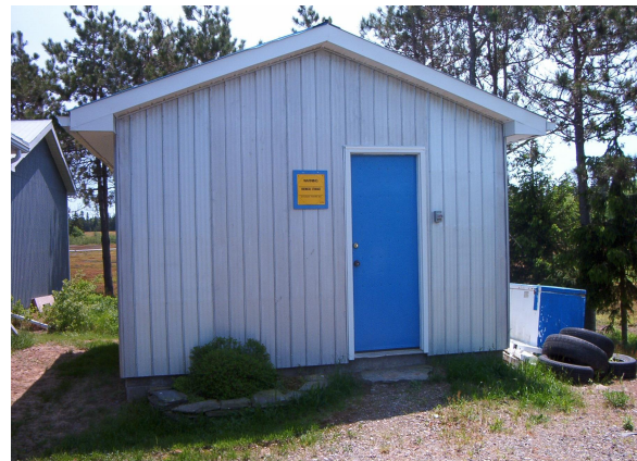
Figure 2: Pesticide Storage Building

When large quantities of pesticides are stored, a separate storage facility should be constructed (Figure 2).