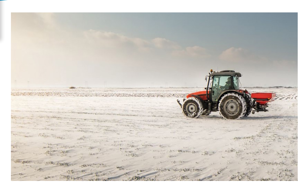
Overseeding on frozen ground or snow is known as "frost seeding".

Part of the popularity of frost seeding is its ease of implementation and low cost. It's also a great way to improve fields that are too rough or hilly to be worked by conventional tillage that would otherwise be at risk of soil erosion. Producers simply buy the seed and broadcast it. Spraying, tillage, picking rocks (nobody likes that job), are optional depending on the site, and there is no loss of production for a season due to re-seeding. If all goes well, the end result can be almost as good as a new seeding at a fraction of the time and fuel costs.