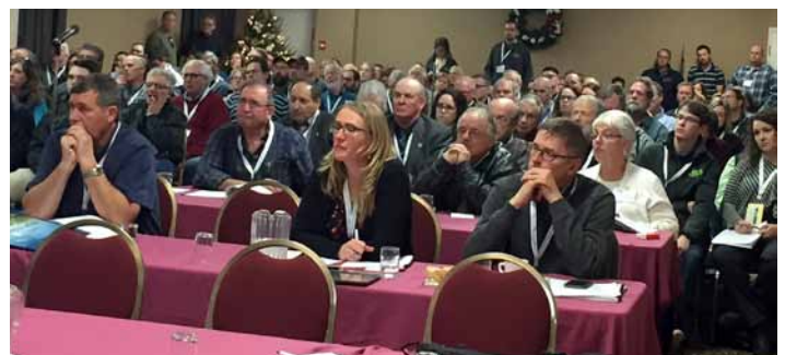
Over 200 people turned out for the NSFA 122 nd AGM

Update on project progress will be included in upcoming News & Views issues.