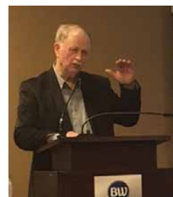
Minister of Agriculture Honourable Keith Colwell addressing the 122 nd AGM

On the second day of the meeting, an update on the Department of Agriculture presented by Deputy Minister Frank Dunn followed the completion of the resolution and Standing Policy discussion. The