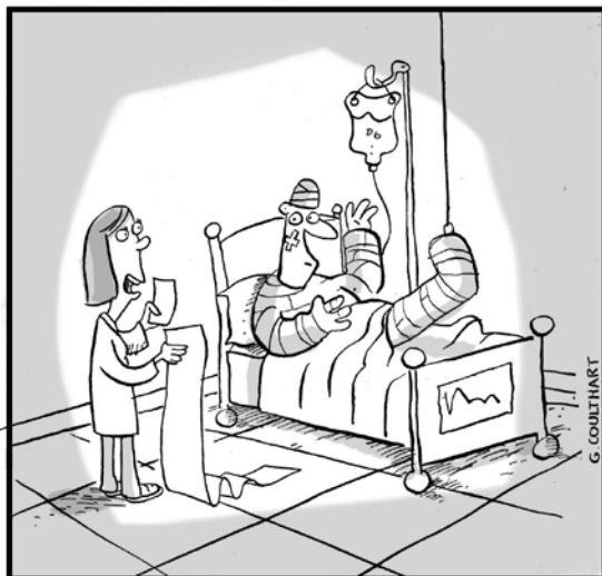
So-it cost $2 for the baler part you didn't fix and $10,000 for lost time and hospital care.