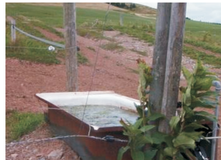
Figure 3. Gravity flow system: source feeding waterline at top of hill and is delivered at water tub.

pressure drop is a problem, then up to 1 ¾ inches diameter may be required. The daily volume is completely dependant on the source (i.e. flow from spring or volume of pond).