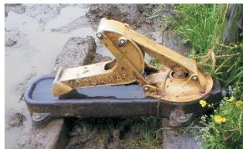
Figure 6. It is preferable to place a pad underneath the nose pump to avoid a mucky drinking area.

Where nose pumps are permanently fixed, installing a pad or trough underneath the pump can reduce mess and can provide water to very young calves that otherwise cannot operate the pump (Figure 6).