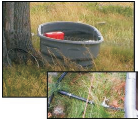
Figure 2. Pipeline system: consists of main line with connectors to tubs in paddocks.

This is the preferred method of watering livestock in Nova Scotia. The source of water usually feeding a pipeline system (Figure 2) is a drilled or dug well, however any other source can be used as long as there is electricity available for a pump to move the water. Wells can provide high volumes of quality water, are very reliable, and pipe can be laid out over a long distance, depending on the head.