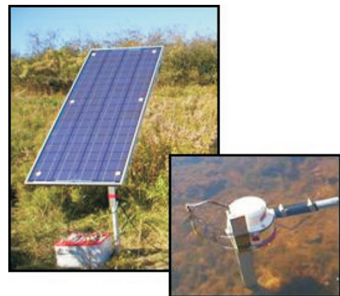
Figure 4. A simple set up of a solar panel, batteries and a submersible pump.

Solar powered pump systems use solar energy to either charge batteries which run a 12-volt pump (Figure 4), or as a direct system which operates the water pump directly. The intake of the water hose can be placed in a stream, pond or shallow well and the outlet should run to a water tank. Three days worth of reserve in either batteries or as a water reservoir is recommended for extended periods of cloud; solar panels can recharge during cloud but at a much reduced rate. The water tub can be fed by gravity from the water tank or reservoir.