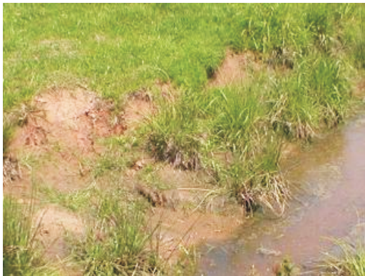
Figure 1. An example of a poor source of water; environmental degradation and a decrease in livestock production can occur.

Impacts on livestock include reduced health, production and rates of gain and a greater chance of injuries. Impacts on the environment include erosion of banks, siltation of watercourses, loss of vegetation and habitat, nutrient build-up in water, and an increased growth of algae and bacteria, which can all have negative effects on aquatic life and water quality.