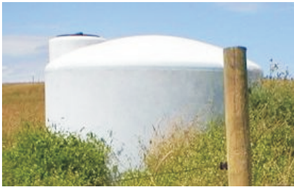
Figure 7. Typical tank used to haul and store water in more remote areas.

This system is practical when no other water source is available to the grazing area. It can be used with a rotational grazing system by moving the trailer at the same time as the animals are moved. Like smaller troughs, algae can grow inside tanks, especially in the hottest part of the summer.