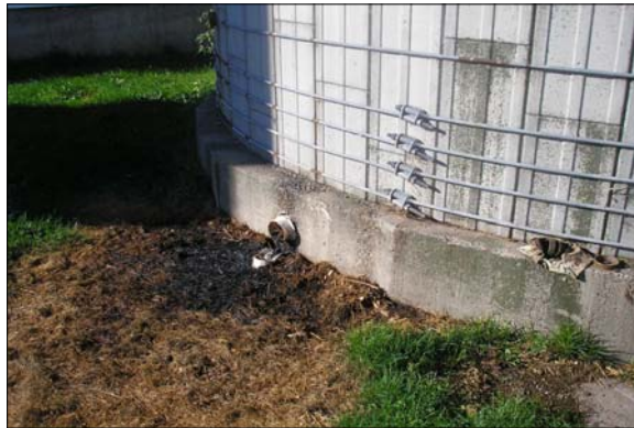
Figure 1: Seepage from an upright silo

A neighbour has contacted the Department of Environment regarding a dark liquid, with a terrible smell, that has appeared in a roadside ditch as well as a nearby brook. The neighbour believes that your farm is to blame.