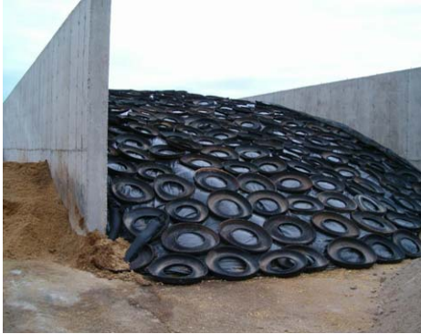
Figure 3: A properly covered bunker silo

The volume of seepage produced increases exponentially as the moisture content increases (Figure 2). Rainwater entering the pile can also contribute to silage seepage in bunker silos and silage piles. Therefore, it is important that rainwater is prevented from entering the bunk by using berms, drainage ditches and by properly covering the pile (Figure 3).